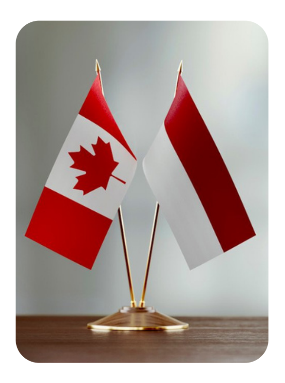
"Promoting positive business growth for social and economic development."

The Indonesia Canada Chamber of Commerce (ICCC) serves our members, the business community, and our stakeholders by: