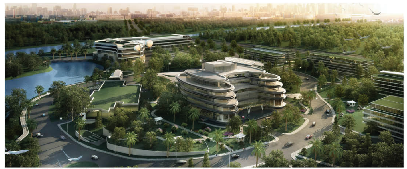
Green Office Park in BSD City: The first certified green office district in Indonesia