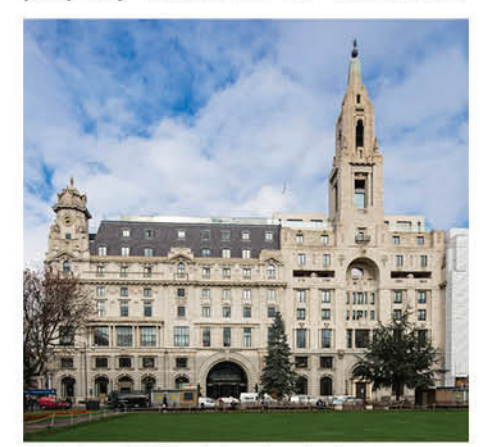
Alphabeta Building in London, the latest expression of the New Economy, acquired by SML in 2015

Sinar Mas Land is one of Indonesia's largest and most diversified property developer. On a land bank of about 10,000 hectares we develop townships, residential areas as well as commercial, hospitality, recreational retail. and industrial properties. Sinar Mas Land is listed on the stock exchanges in Singapore and Jakarta (with a combined market capitalization in excess of US 3.5 billion), from where we engage in property business in Indonesia,