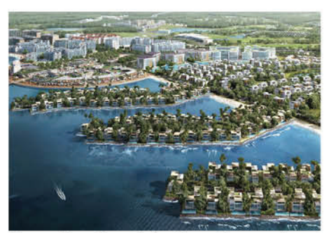
Nuvasa Bay : Batam's first luxury integrated residential and mixed-use development

China, Malaysia, Singapore and the United Kingdom. SML is rated as Indonesia's strongest real estate company.